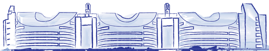
Queen Elizabeth Hospital Birmingham

We have launched a new appeal to bring a Mobile CT Scanner to the hospital, which could save the lives of those with severe head injuries. Read more about this remarkable piece of equipment and the difference that it could make on pages 16 and 17.