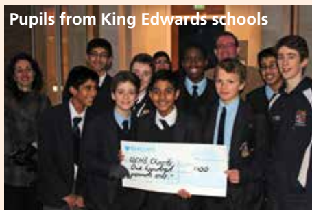
Pupils from King Edwards schools

The fundraising youngsters enjoyed a host of Easter activities and held a picnic to raise funds. They also donated some new children's books for the brand new waiting area.