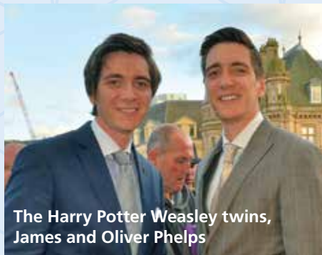
The Harry Potter Weasley twins, James and Oliver Phelps