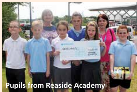
Pupils from Reaside Academy