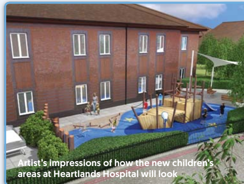
Artist's impressions of how the new children's areas at Heartlands Hospital will look

The garden will encompass an inside space for sheltered activities. This child-friendly environment will provide a