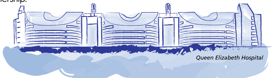
Queen Elizabeth Hospital